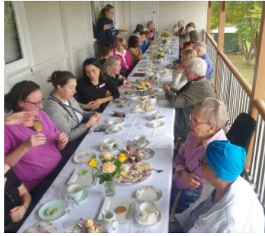
June and August High Tea @ the Rectory