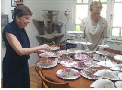
High tea preparations