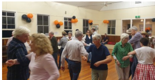
Bush Dance in July